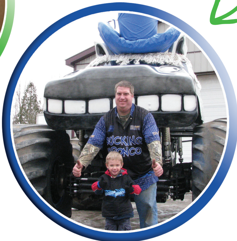
"A Monster Truck Maniac"

partners. Our community vision is to "work together as a seamless system."