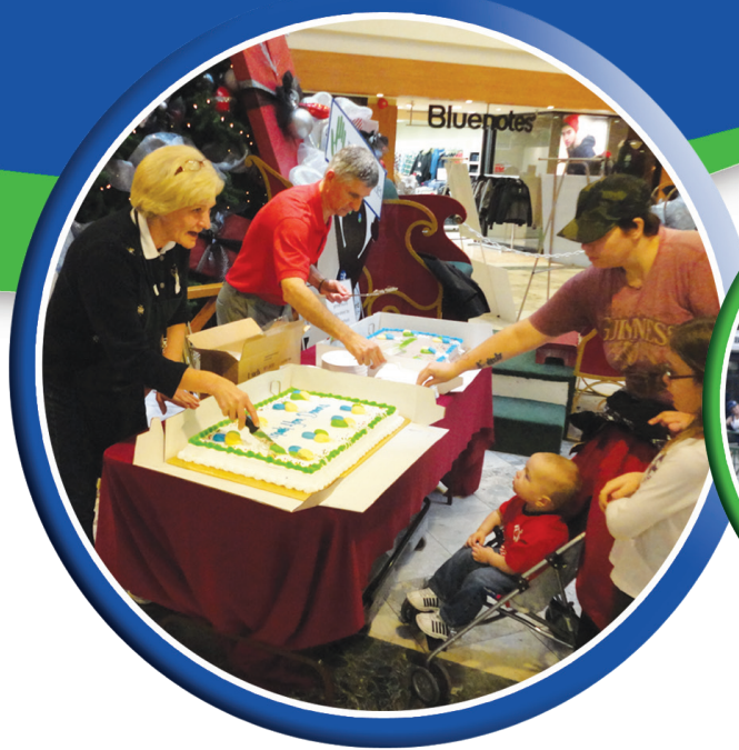
Thank you to our donors