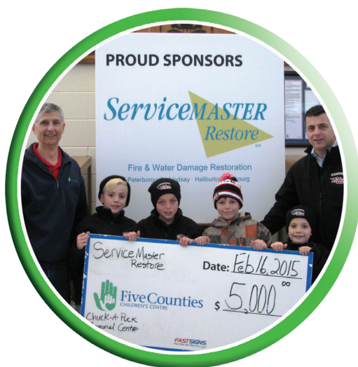
Family Day at the Petes game