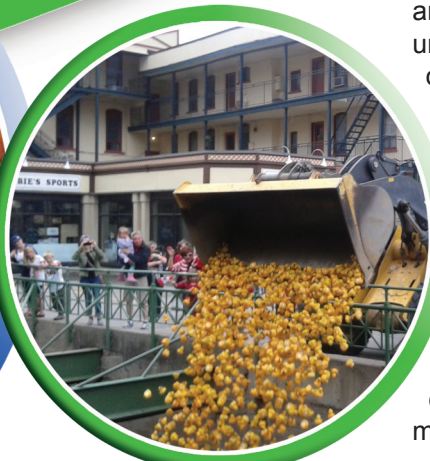
Kinette Duck Race

network for pediatric patients in hospitals and health care facilities. This is geared to teens who suffer stress, isolation and loneliness because of their diagnosis and hospitalization. Medical information is provided and the hope is that these adolescents will keep connected with their family, friends and social community.